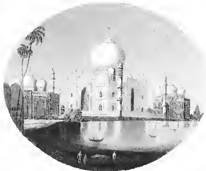
The Taj Mahal at Agra